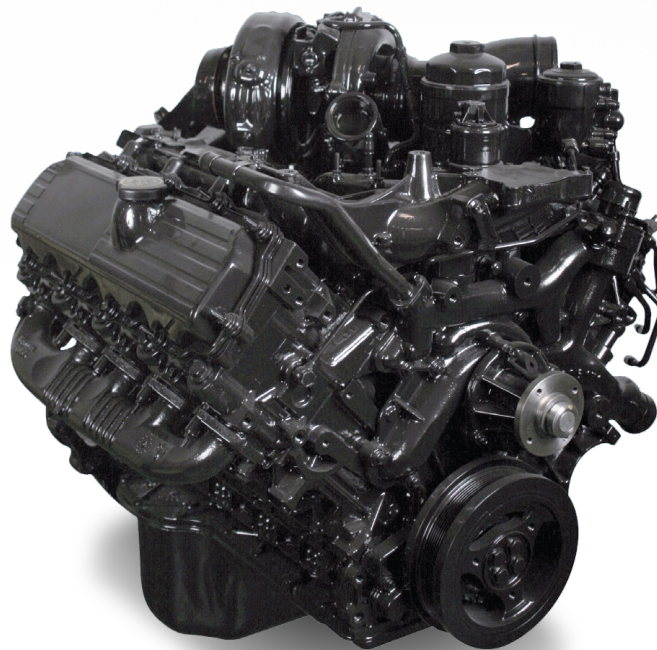
6.0L Power Stroke® Diesel