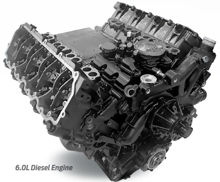
6.0L Diesel Engine